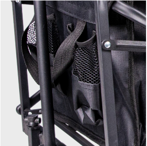
Features two handy integrated cup holders