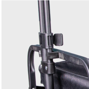
Telescopic handle with integrated lock to keep it in place at the desired length