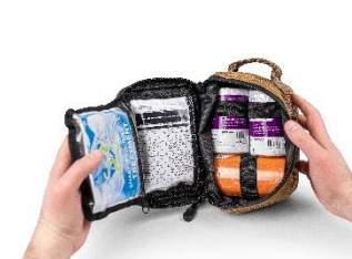
Internal fold out compartments to assist with kit organisation