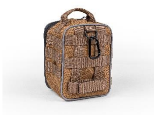
Case strapping and karabiner for safely securing your kit to almost anything