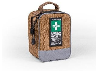
Ultra-tough portable khaki soft case design with reflective tape for visibility