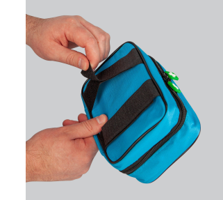
Adjustable belt loop straps for portability