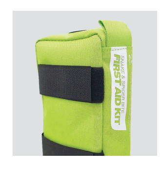
Portable grab and run soft pack case design with belt loops