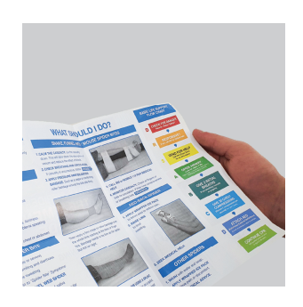
Full colour snake and spider identification sheet and treatment guide