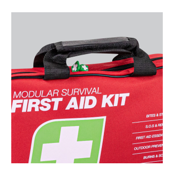
Portable grab and run soft pack case design with water resistant fabric backing