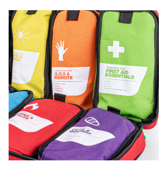
Modular design enables fast and easy access to the right contents