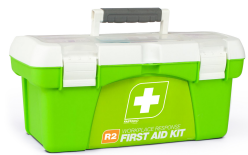
Rugged portable grab and run tackle box case design