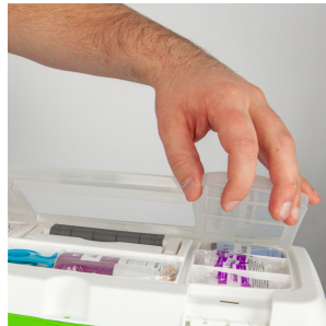
Colour coded contents to make locating the correct item fast and easy