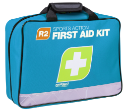
Portable grab and run soft pack case design with water resistant fabric backing