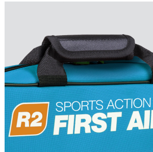
Portable grab and run soft pack case design with water resistant fabric backing