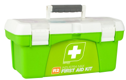
Rugged portable grab and run tackle box case design