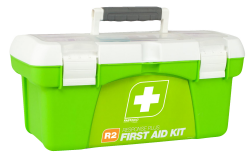
Rugged portable grab and run tackle box case design