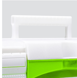
Integrated carry handle for portability