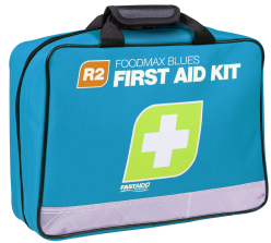
Portable grab and run soft pack case design with water resistant fabric backing