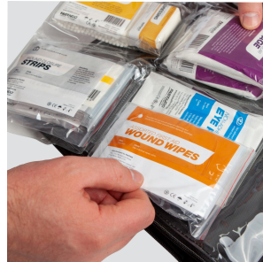
Colour coded contents to make locating the correct item fast and easy