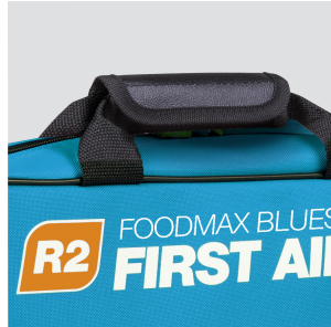
Portable grab and run soft pack case design with water resistant fabric backing