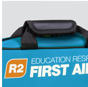
Portable grab and run soft pack case design with water resistant fabric backing