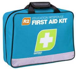
Portable grab and run soft pack case design with water resistant fabric backing