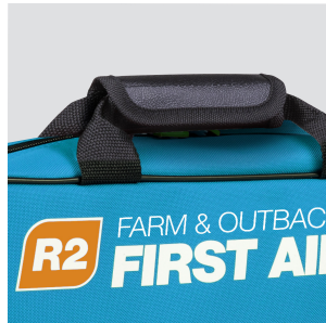
Portable grab and run soft pack case design with water resistant fabric backing