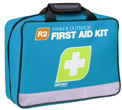
Portable grab and run soft pack case design with water resistant fabric backing