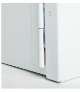
Premium heavy gauge wall mountable steel cabinet