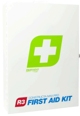
Premium heavy gauge wall mountable steel cabinet