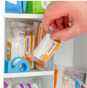
Colour coded contents to make locating the correct item fast and easy