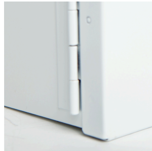
Premium heavy gauge wall mountable steel cabinet