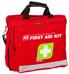
Portable grab and run soft pack case design with water resistant fabric backing