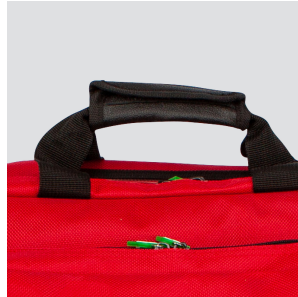
Portable grab and run soft pack case design with water resistant fabric backing